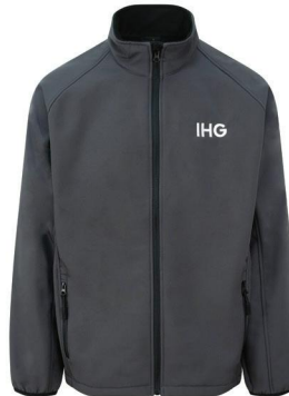
Men's Soft Shell Jacket - Grey Single pack PVID IHMSS01GY - £26.50 Size Range S - 4XL