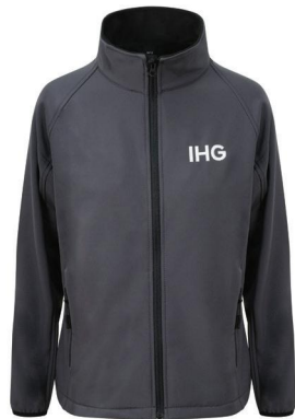
Ladies' Soft Shell Jacket - Grey

Trousers are delivered unhemmed (36" length) with wonderweb pack to finish to your required length