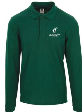
Unisex Long Sleeve Polo Shirt - Green