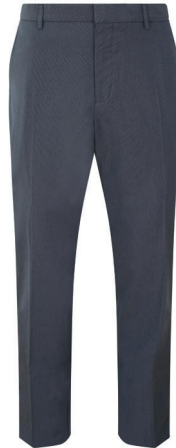
Men's Trouser - Navy Single pack PVID IHMTR01NV - £20.30 Twin pack PVID IHMTR21NV - £38.60 Size Range Waist 28" - 50" Trousers are delivered unhemmed (36" length) with wonderweb pack to finish to your required length