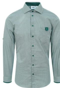
Ladies' Roll-Up Sleeve Shirt - Green/ White Micro Check