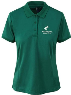
Ladies' Short Sleeve Polo Shirt - Green