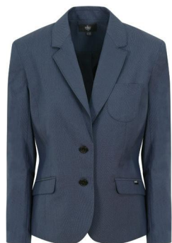
Ladies' Suit Jacket - Navy