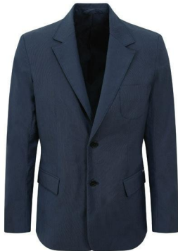
Men's Suit Jacket - Navy Single pack PVID IHMJK01NV - £47.50 Size Range 36" - 48" Short, Std & Long