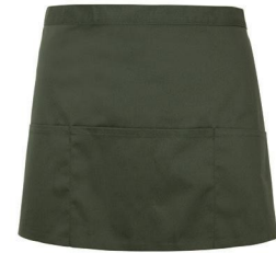
Unisex Short Apron - Charcoal