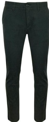
Ladies' Chino Trouser - Charcoal