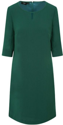
Ladies' Shift Dress - Green Single pack PVID HIFDR02GR - £36.20 Twin pack PVID HIFDR22GR - £70.40 Size Range UK 6 - 26 Length 23"