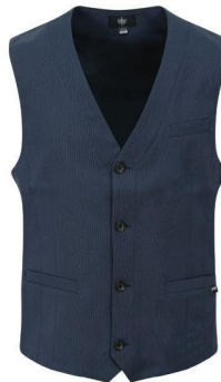
Men's Waistcoat - Navy Single pack PVID HIMWC01NV - £22.50 Twin pack PVID HIMWC21NV - £43.00 Size Range 36" - 48"