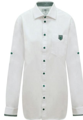
Men's Roll-Up Sleeve Shirt - White Single pack PVID HIMSH02WH - £16.70 Twin pack PVID HIMSH22WH - £31.40 Size Range Collar 14.5" - 19.5"