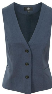
Ladies' Waistcoat - Navy