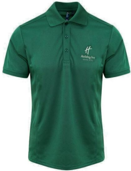
Men's Short Sleeve Polo Shirt - Green Single pack PVID HIMPO01GR - £12.70 Size Range S - 4XL