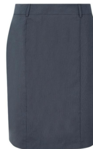
Ladies' Pencil Skirt - Navy