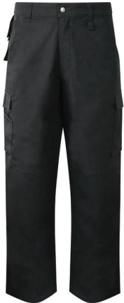
Men's Cargo Trousers - Black Single pack PVID IHMTR04BK - £26.50 Size Range Waist 28" - 48" Short, Std & Long

Trousers are delivered unhemmed (36" length) with wonderweb pack to finish to your required length